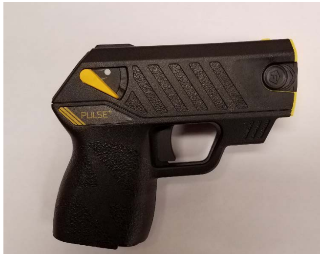
Government Appeal Exhibit No. 5

The day after the insurrection, January 7, 2021, the defendant told a reporter for The Times (of London) that he had traveled to Washington "to show that we're willing to rise up, band together and fight if necessary. Same as our forefathers, who established this country in 1776." See https://www.thetimes.co.uk/article/trumps-militias-say-they-are-armed-and-ready-to-defend-their-freedoms-8ht5m0j70 (last viewed January 23, 2021). He elaborated that the insurgence upon